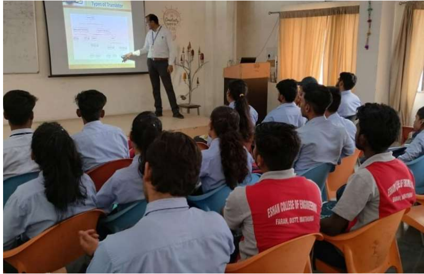
Students listening to presentation of exhibiting engineering solutions